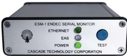
ESM-1 Front View