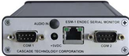
ESM-1 Back View