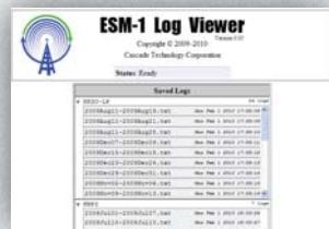
ESM-1 Log Viewer Saved Logs - Included Software