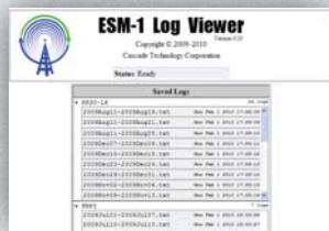
ESM-1 Log Viewer Saved Logs - Included Software